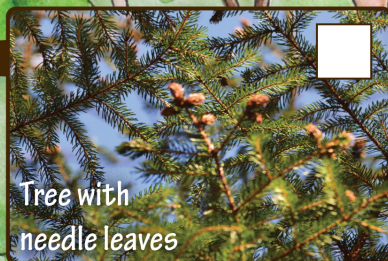
Tree with needle leaves