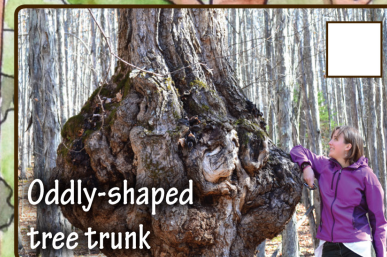
Oddly-shaped tree trunk