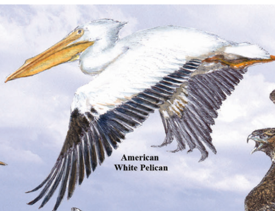
American White Pelican