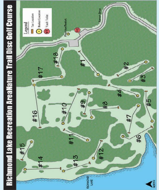
Richmond Lake Recreation Area Nature Trail Disc Golf Course

Safety: Disc golf discs can cause serious damage to people and property. You are responsible for any damage caused by your disc. Be aware of your surroundings and be patient of others. Do not stand in front of other players who are throwing, and don't throw when other players are in front of you!