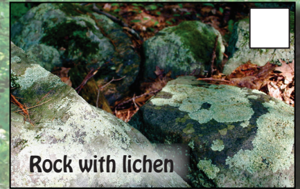
Rock with lichen