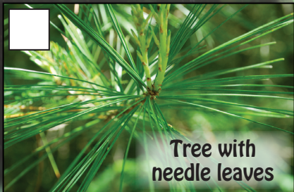
Tree with needle leaves