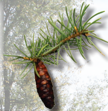
Black Hills Spruce

Fall is a great time of year to hike at the Arboretum. You can see nature preparing for winter. During your hike today, see how many of these trees that help paint the landscape you can find.