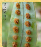
Leaflet with sori

Most plants use seeds to reproduce, but ferns use single cells called spores . Depending on the fern species, spore-producing objects called sori are found on either fronds or stalks. Some spores that are released and find moist ground will germinate. Can you find sori on a fern? _____