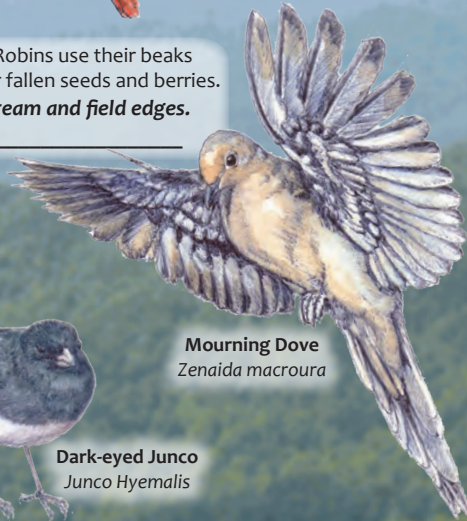
Mourning Dove Zenaidura macroura