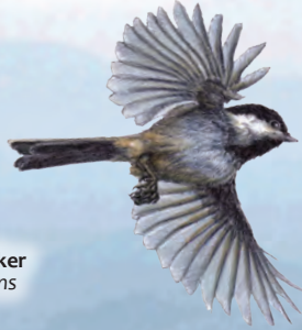
Carolina Chickadee Poecile carolinensis