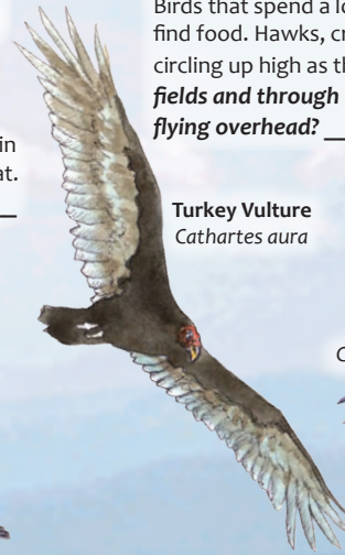
Turkey Vulture Cathartes aura

Birds that spend a lot of time in the air use their strong eyesight to find food. Hawks, crows and vultures can usually be found perched or circling up high as they search for their next meal. Scan the sky over fields and through openings in the trees. Are there any large birds flying overhead? _____ Are they flapping or gliding? _____