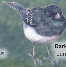
Dark-eyed Junco Junco hyemalis