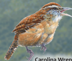
Carolina Wren Thryothorus ludovicianus

Birds make all kinds of noises – some sing to attract a mate, while others will call attention to food, danger or territory. Carolina wrens are known for their loud, cheerful song and chattering sounds. Northern mockingbirds can imitate hundreds of different sounds, and will sometimes sing at night! Close your eyes and listen for one minute. How many different birds can you hear around you? _____