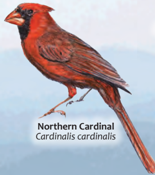
Northern Cardinal Cardinalis cardinalis