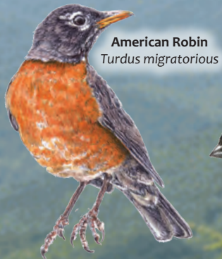
American Robin Turdus migratorius

Birds that feed on the ground usually specialize in catching bugs or finding seeds. American Robins use their beaks to pull earthworms from the ground. Juncos and towhees scratch through leaves to uncover fallen seeds and berries. Mourning doves peck insects and seeds from gravelly areas. Check the ground near trail, stream and field edges. How many different birds can you find? _____ Can you tell what they are eating? _____