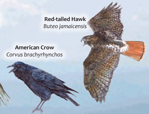
Red-tailed Hawk Buteo jamaicensis