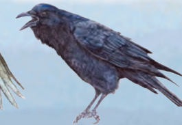
American Crow Corvus brachyrhynchos