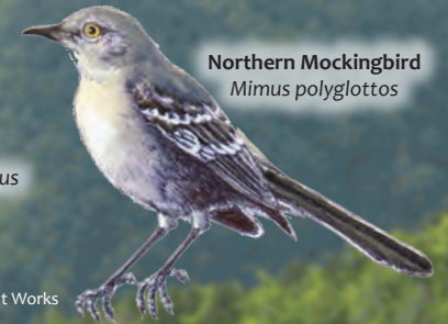
Northern Mockingbird Mimus polyglottos