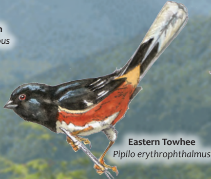
Eastern Towhee Pipilo erythrophthalmus