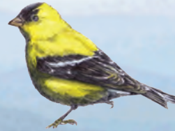
American Goldfinch Carduelis tristis