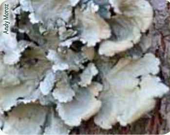
Powdered Ruffle Lichen Parmotrema hypotropum

Look for little black 'hairs' called cilia!