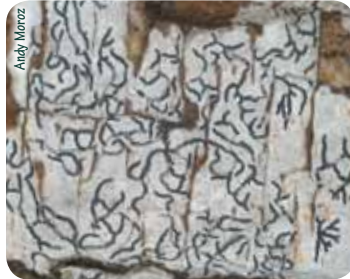
Script Lichen Graphis scripta

Many lichens don't have a common name. What would you name this lichen? _____