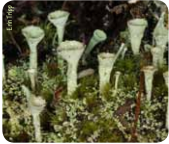
Pixie Cup Lichen Cladonia chlorophaea