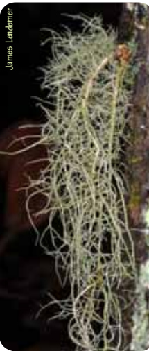
Old Man's Beard Usnea dasaea

Lichens come in many shapes, sizes and... colors!