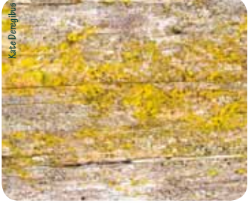
Gold Dust Lichen Chrysothrix xanthina