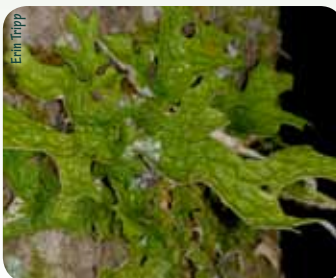
Lungwort Lichen Lobaria pulmonaria

Look for little black 'hairs' called cilia!