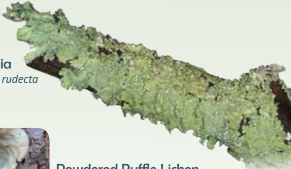
Punctelia Punctelia rudecta

Foliose lichens look like dry, wavy foliage (leaves). The edges curl off the surface the lichen is growing on.