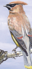
Cedar Wax Wing