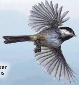
Carolina Chickadee Poecile carolinensis