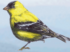
American Goldfinch Carduelis tristis