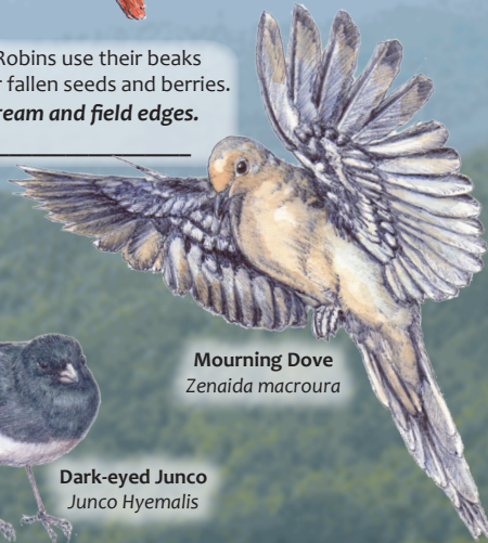
Mourning Dove Zenaidura macroura