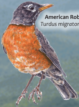
American Robin Turdus migratorius

Birds that feed on the ground usually specialize in catching bugs or finding seeds. American Robins use their beaks to pull earthworms from the ground. Juncos and towhees scratch through leaves to uncover fallen seeds and berries. Mourning doves peck insects and seeds from gravelly areas. Check the ground near trail, stream and field edges. How many different birds can you find? _____ Can you tell what they are eating? _____