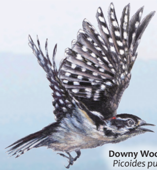
Downy Woodpecker Picoides pubescens

Almost all the birds of the Blue Ridge use trees and shrubs for food, shelter, or nesting. Woodpeckers and chickadees make their nests in the cavities of trees and pick insects from the bark. Trees can provide seeds and berries for birds such as cardinals and goldfinches to eat. Look into the trees. How many different birds can you find? _____ What parts of the tree are the birds using? _____