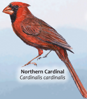
Northern Cardinal Cardinalis cardinalis