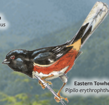
Eastern Towhee Pipilo erythrophthalmus