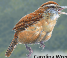
Carolina Wren Thryothorus ludovicianus