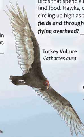
Turkey Vulture Cathartes aura

Birds that spend a lot of time in the air use their strong eyesight to find food. Hawks, crows and vultures can usually be found perched or circling up high as they search for their next meal. Scan the sky over fields and through openings in the trees. Are there any large birds flying overhead? _____ Are they flapping or gliding? _____