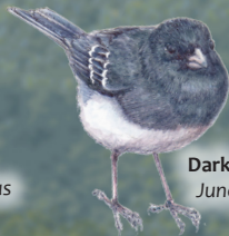
Dark-eyed Junco Junco hyemalis