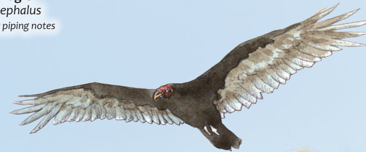
○ Turkey Vulture Cathartes aura low, throaty hissing