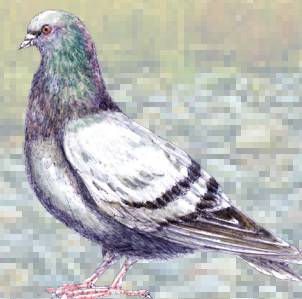
○ Rock Dove (Pigeon) Columba livia throaty "coos"