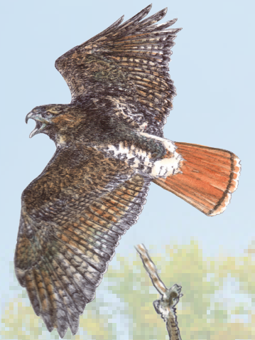
○ Red-tailed Hawk Buteo jamaicensis hoarse, screaming "kee-eeee-arr"