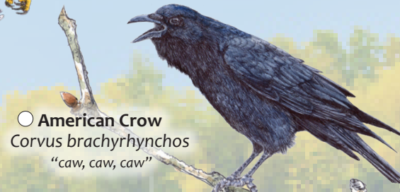
○ American Crow Corvus brachyrhynchos "caw, caw, caw"