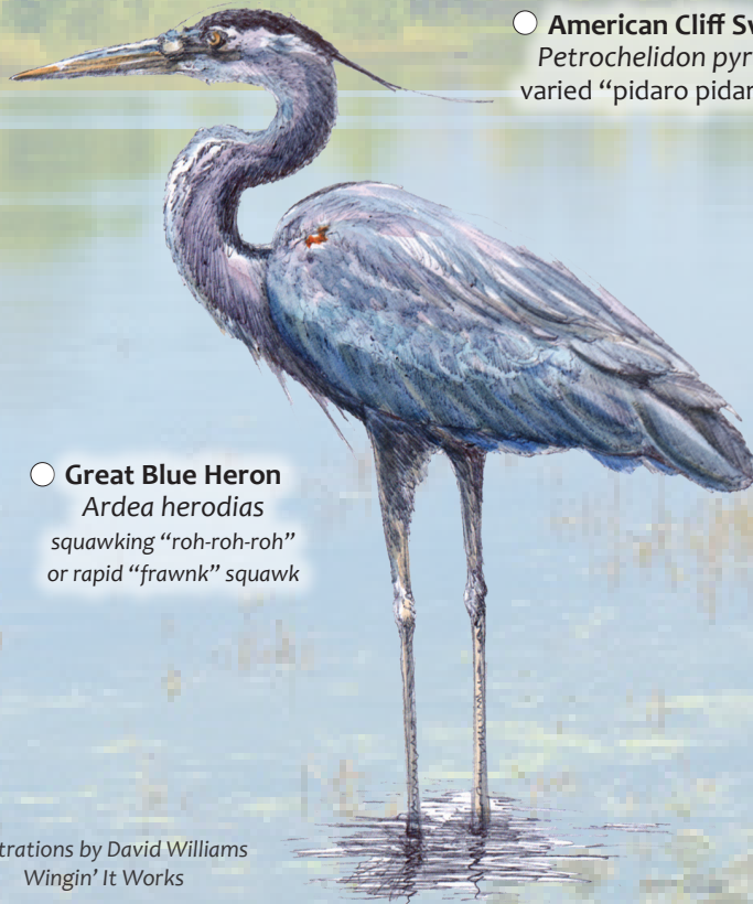
○ Great Blue Heron Ardea herodias squawking "roh-roh-roh" or rapid "frawnk" squawk