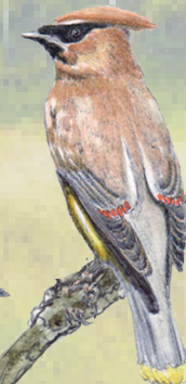
○ Cedar Waxwing Bombicilla cedrorum high-pitched, trilled "bzeee"