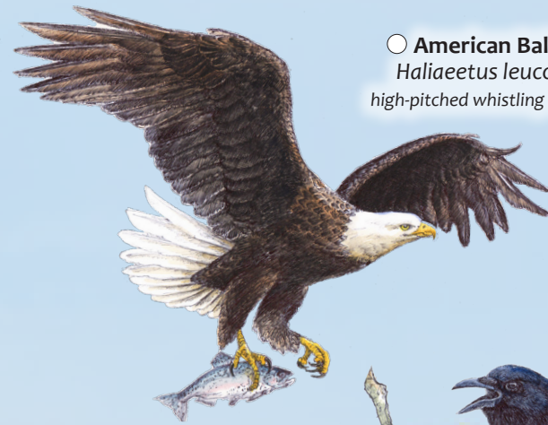
○ American Bald Eagle Haliaeetus leucocephalus high-pitched whistling or piping notes

Check off the birds you find on your hike today!