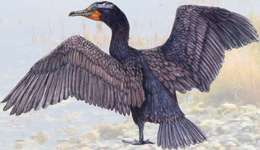
○ Double-crested Cormorant Phalacrocorax auritus pig-like grunts

Whether perching in the trees, wading in the shallows, flying overhead, or singing from the shrubs, many types of birds specialize in a life on or near the river. Use this brochure to see how many birds you can find on your hike today.