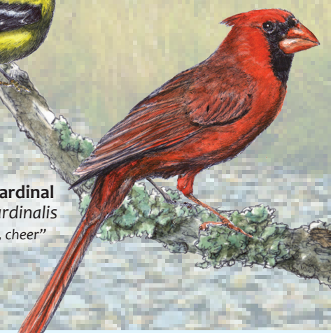
○ Northern Cardinal Cardinalis cardinalis "cheer, cheer, cheer"