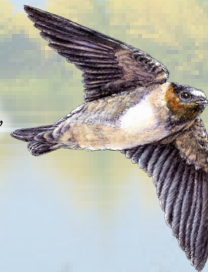
○ American Cliff Swallow Petrochelidon pyrrhonota varied "pidaro pidaro pidaro"