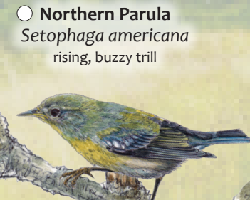
○ Northern Parula Setophaga americana rising, buzzy trill