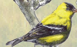
○ American Goldfinch Spinus tristis "po-ta-to-chip"