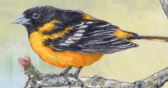
○ Baltimore Oriole Icterus galbula series of short notes; flute-like sound