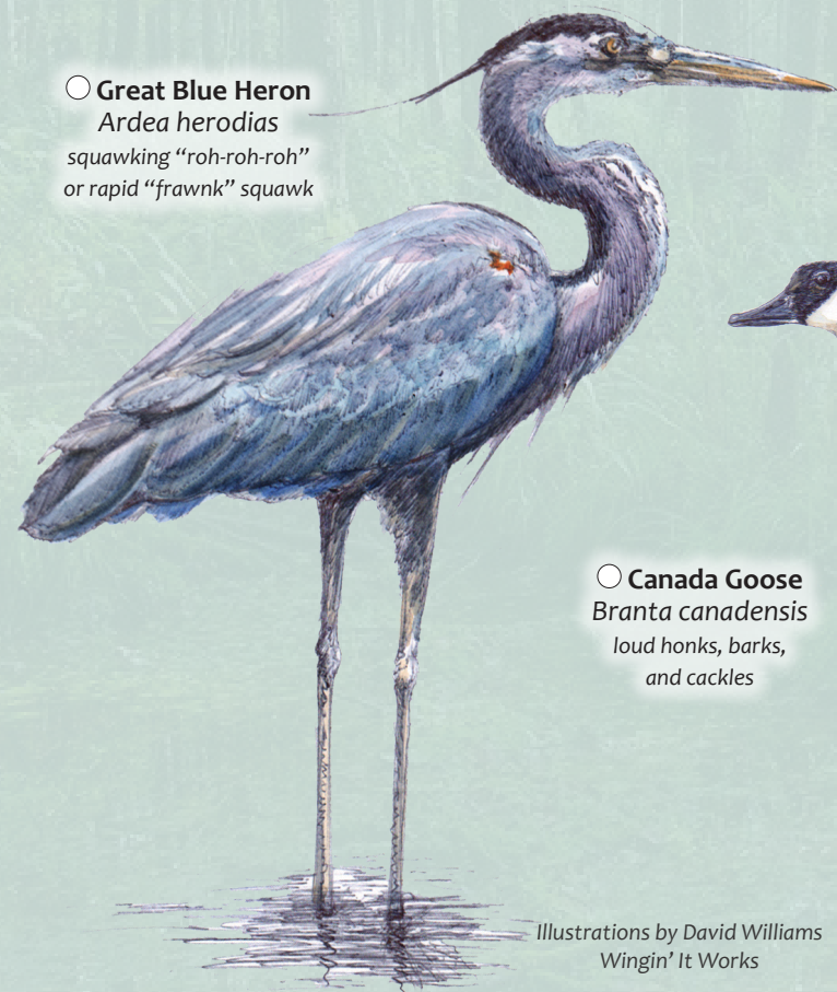
○ Great Blue Heron Ardea herodias squawking “roh-roh-roh” or rapid “frawnk” squawk