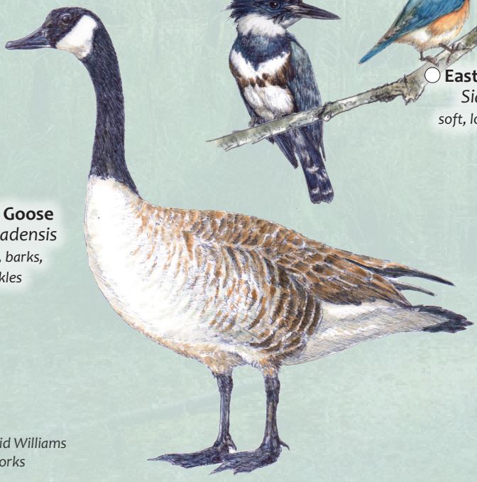
○ Canada Goose Branta canadensis loud honks, barks, and cackles