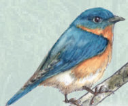
○ Eastern Bluebird Sialia sialis soft, low “tu-a-wee”