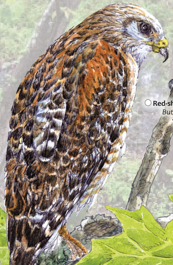
○ Red-shouldered Hawk Buteo lineatus “kee-aah”

Whether perching in the trees, wading in the shallows, flying overhead, or singing from the shrubs, many types of birds specialize in a life in the woods and wetlands. Use this brochure to see how many birds you can find on your hike today.