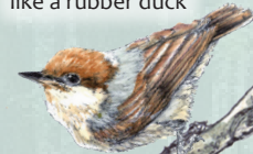
○ Brown-headed Nuthatch Sitta pusilla High-pitched squeak, like a rubber duck