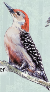
○ Red-bellied Woodpecker Melanerpes carolinus rolling “kwirr”