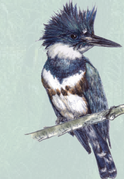
○ Belted Kingfisher Megaceryle alcyon harsh, mechanical rattles