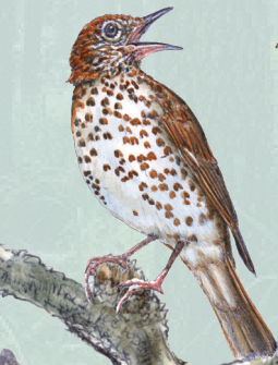
○ Wood Thrush Hylocichla mustelina flute-like “ee-oh-lay”