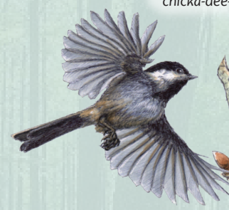
○ Carolina Chickadee Poecile carolinensis “chicka-dee-dee-dee”