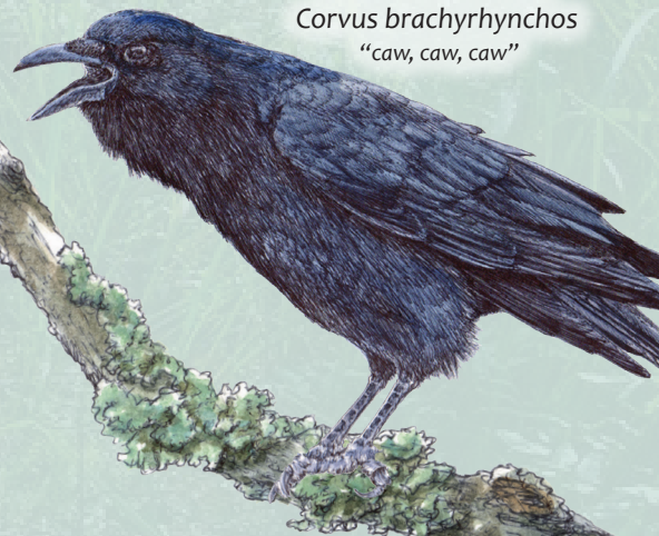
○ American Crow Corvus brachyrhynchos “caw, caw, caw”