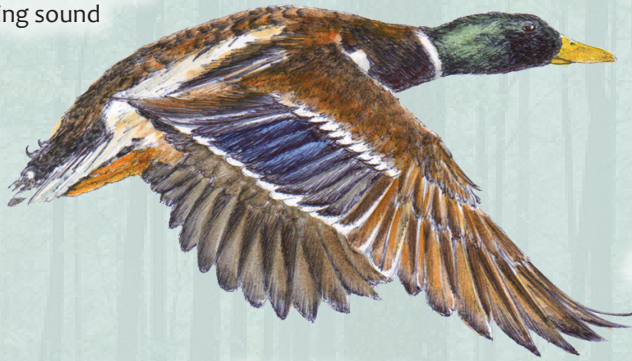
○ Mallard Anas platyrhynchos standard duck’s quack, but males make quieter rasping sound