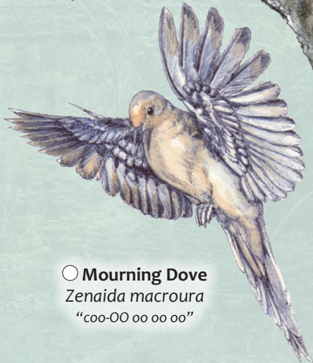
○ Mourning Dove Zenaida macroura “coo-OO oo oo oo”