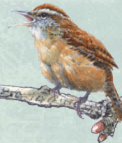
○ Carolina Wren Thryothorus ludovicianus quick, whistle. “teakettle”