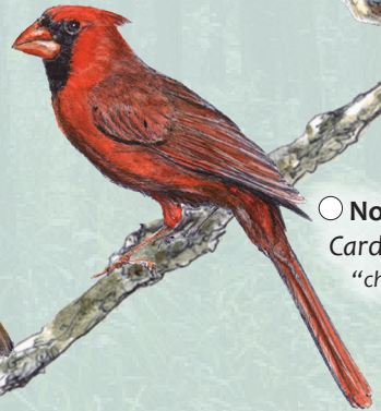
○ Northern Cardinal Cardinalis cardinalis “cheer-cheer-cheer”