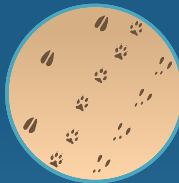
● Animal Tracks