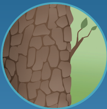
● Rough Bark