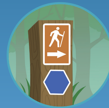
● Something Human-made