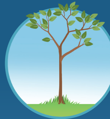
● Sapling (young tree)