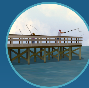
● Fishing Pier