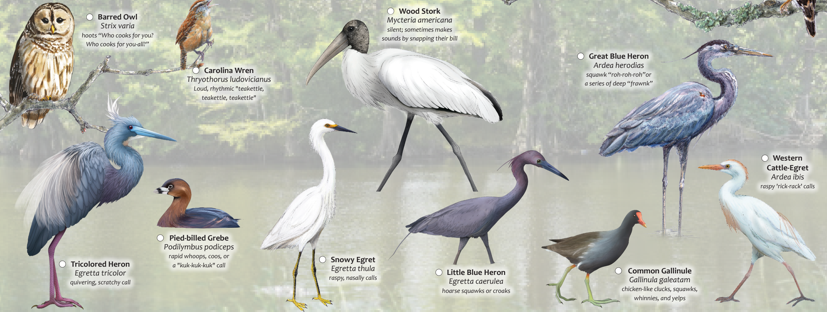
○ Barred Owl Strix varia hoots "Who cooks for you? Who cooks for you-all?"