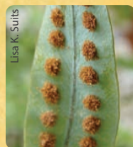
Leaflet with sori

Most plants use seeds to reproduce, but ferns use single cells called spores . Depending on the fern species, spore-producing objects called sori are found on either fronds or stalks. Some spores that are released and find moist ground will germinate. Can you find sori on a fern? _____