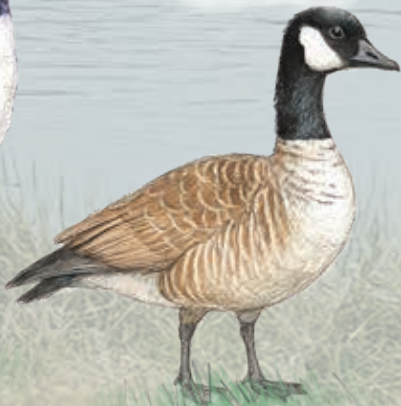
Cackling Goose Branta hutchinsii high-pitched yelps