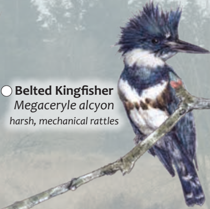
Belted Kingfisher Megascyle alcyon harsh, mechanical rattles