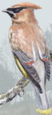
Cedar Waxwing Bombycilla cedrorum high pitched ‘see’ or ‘bzeee’