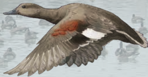
Gadwall Mareca strepera “bek! bek! bek!”