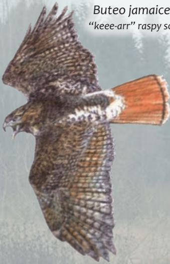
Red-tailed Hawk Buteo jamaicensis “keee-arr” raspy scream