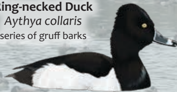
Ring-necked Duck Aythya collaris series of gruff barks