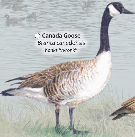
Canada Goose Branta canadensis honks “h-ronk”