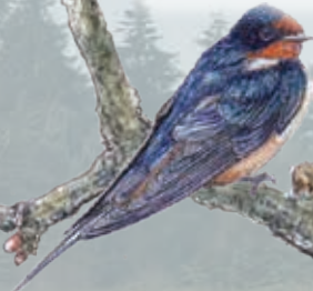
Barn Swallow Hirundo rustica series of warbles followed by mechanical “whirrs”