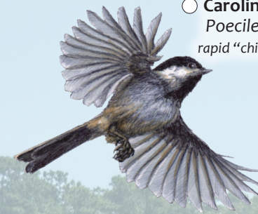
○ Carolina Chickadee Poecile carolinensis rapid "chickadee-dee-dee"