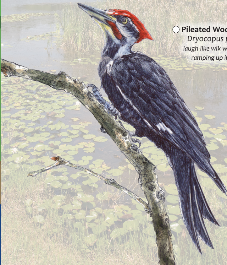
○ Pileated Woodpecker Dryocopus pileatus laugh-like wik-wik-wik-wik, ramping up in speed.

Whether perching in the trees, wading in the creek, flying overhead, or singing from the shrubs, many types of birds specialize in a life in the pine savannah. Use this brochure to see how many birds you can find on your hike today.