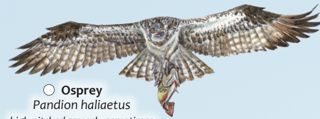
○ Osprey Pandion haliaetus high-pitched screech, sometimes strung together in a series

Check off the birds you find on your hike today!