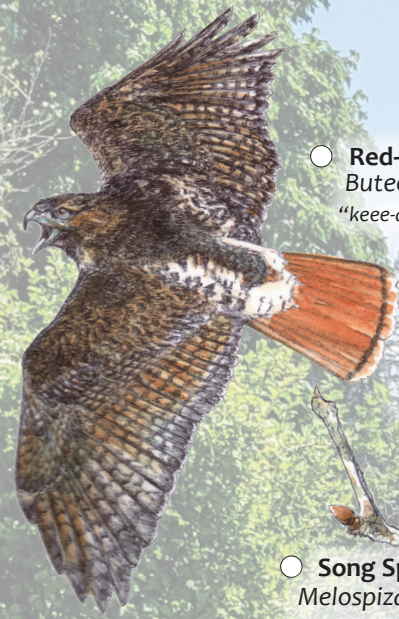
Red-tailed Hawk Buteo jamaicensis "keee-arr" raspy scream

Check off the birds you find on your hike today!