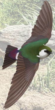
Violet-green Swallow Tachycineta thalassina string of twitters or chirps