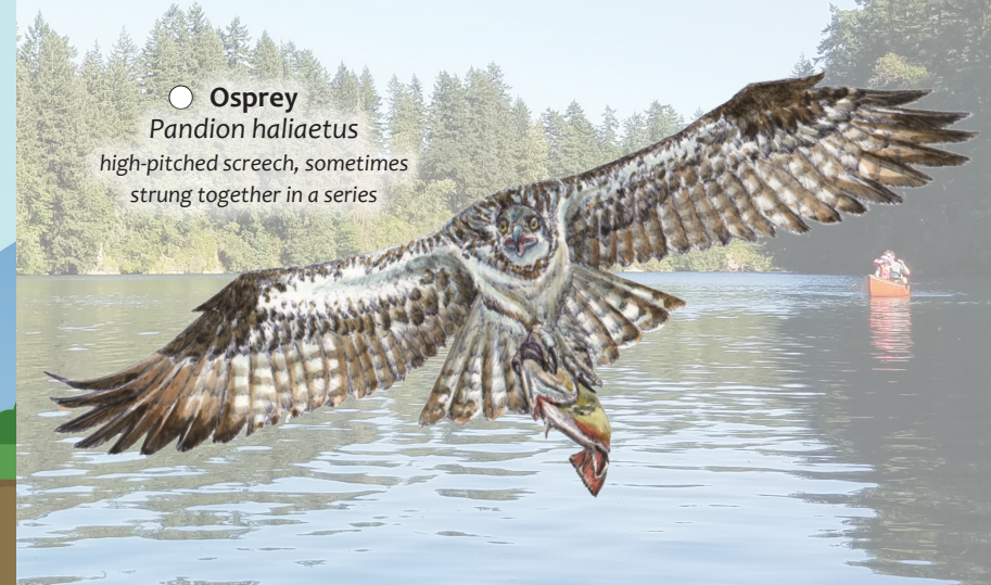
● Osprey Pandion haliaetus high-pitched screech, sometimes strung together in a series

Whether perched along the bank, wading in the water, or flying overhead, there are many birds to observe at Estacada Lake. Use this brochure to learn about the birds that call this place home and see how many you can find on your hike!