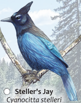
Steller's Jay Cyanocitta stelleri raspy and repetitive "shook shook shook"