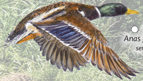
Mallard Anas platyrhynchos series of quacks