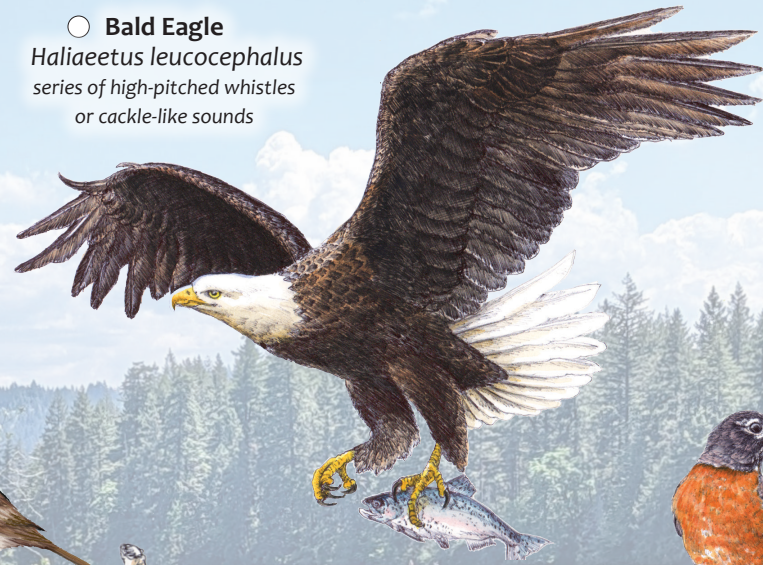
Bald Eagle Haliaeetus leucocephalus series of high-pitched whistles or cackle-like sounds