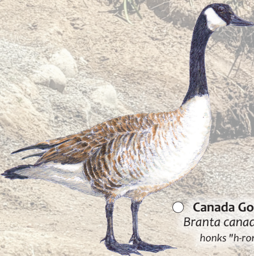
Canada Goose Branta canadensis honks "h-ronk"