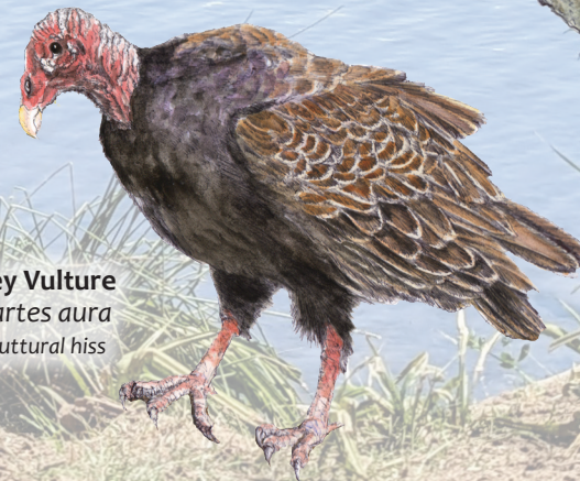
Turkey Vulture Cathartes aura low, guttural hiss