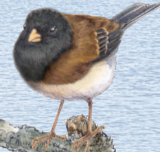
Dark-eyed Junco Junco hyemalis series of rhythmic whistles, trills, and warbles