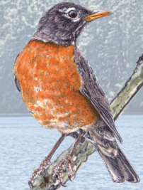
American Robin Turdus migratorius whistles a string of "cheerily, cheer up, cheer up"