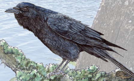
American Crow Corvus brachyrhynchos series of loud, harsh caws or a mixture of coos, caws, and clicks