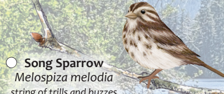
Song Sparrow Melospiza melodia string of trills and buzzes