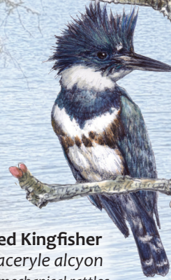
Belted Kingfisher Megaceryle alcyon harsh, mechanical rattles