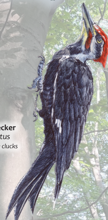
Pileated Woodpecker Dryocopus pileatus repetitive, monkey-like clucks

Whether perched in a tree, wading in the water, or flying overhead, there are many bird species to observe at South Cove County Park. Use this brochure to learn about the birds that call this place home and see how many you can find on your hike!