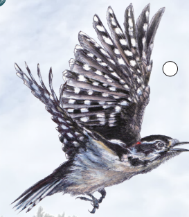
Downy Woodpecker Dryobates pubescens high pitched "pik, pik, pik"

Check off the birds you find on your hike today!