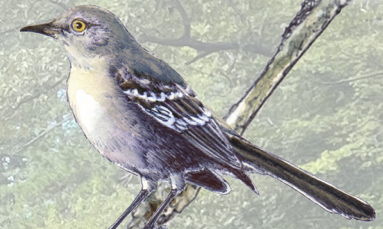
Northern Mockingbird Mimus polyglottos various notes of "krrDEE krrDEE" or "chew, chew, chew"