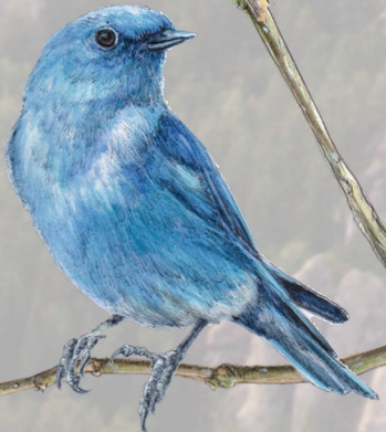
Mountain Bluebird Sialia currucoides Terr (low call)