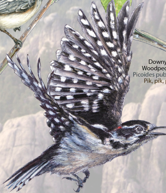
Downy Woodpecker Picoides pubescens Pik, pik, pik