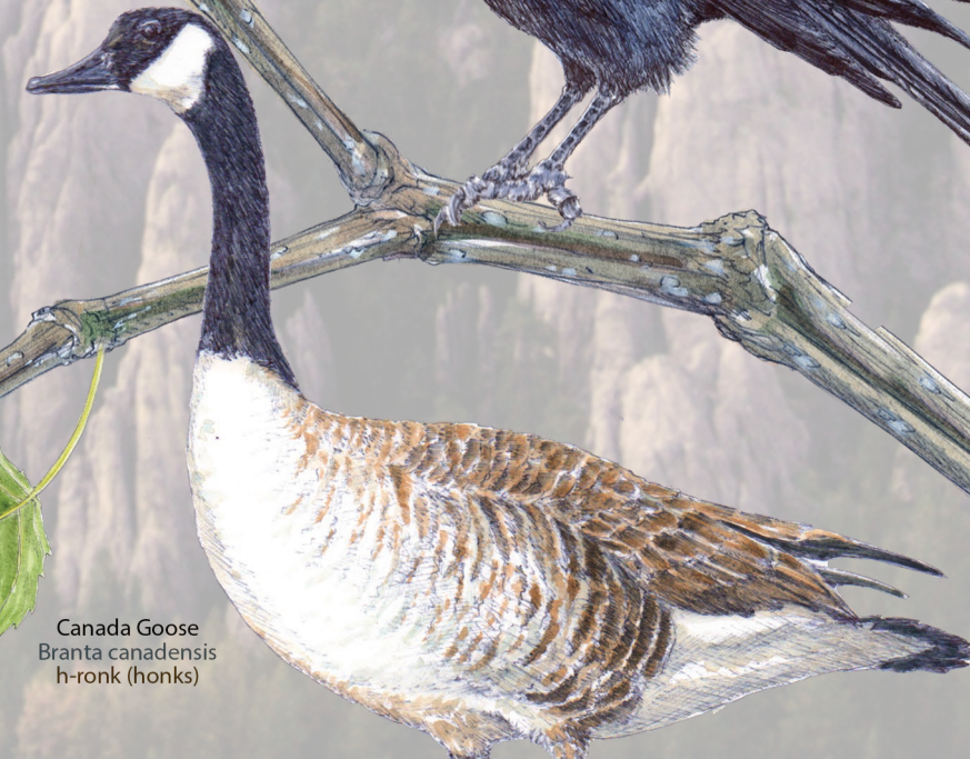
Canada Goose Branta canadensis h-ronk (honks)