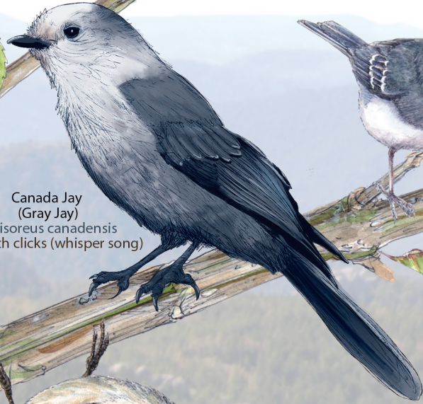
Canada Jay (Gray Jay) Perisoreus canadensis Soft with clicks (whisper song)