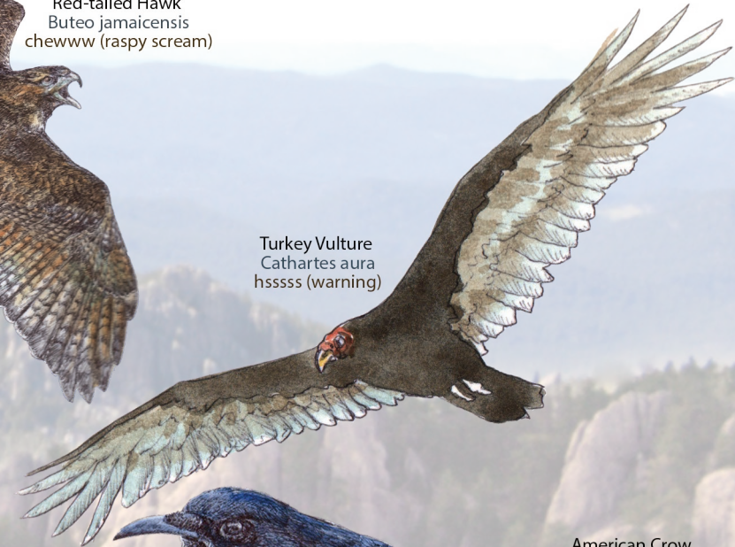
Turkey Vulture Cathartes aura hsssss (warning)