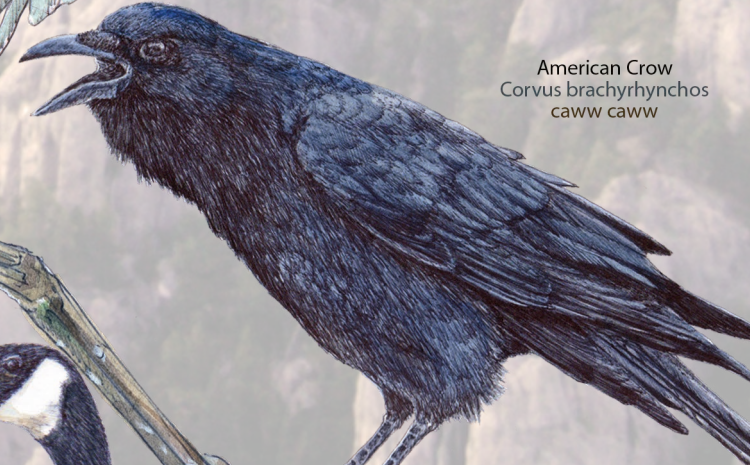
American Crow Corvus brachyrhynchos caww caww