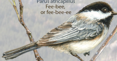
Black-capped Chickadee Parus atricapillus Fee-bee, or fee-bee-ee