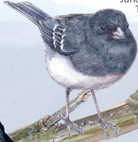
Dark-eyed Junco (white-winged) Junco hyemalis Tik (call)