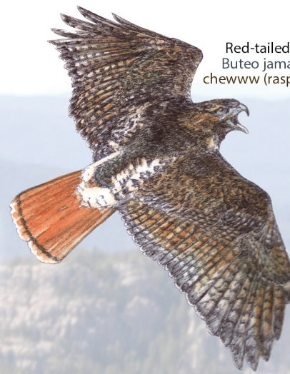
Red-tailed Hawk Buteo jamaicensis chewww (raspy scream)