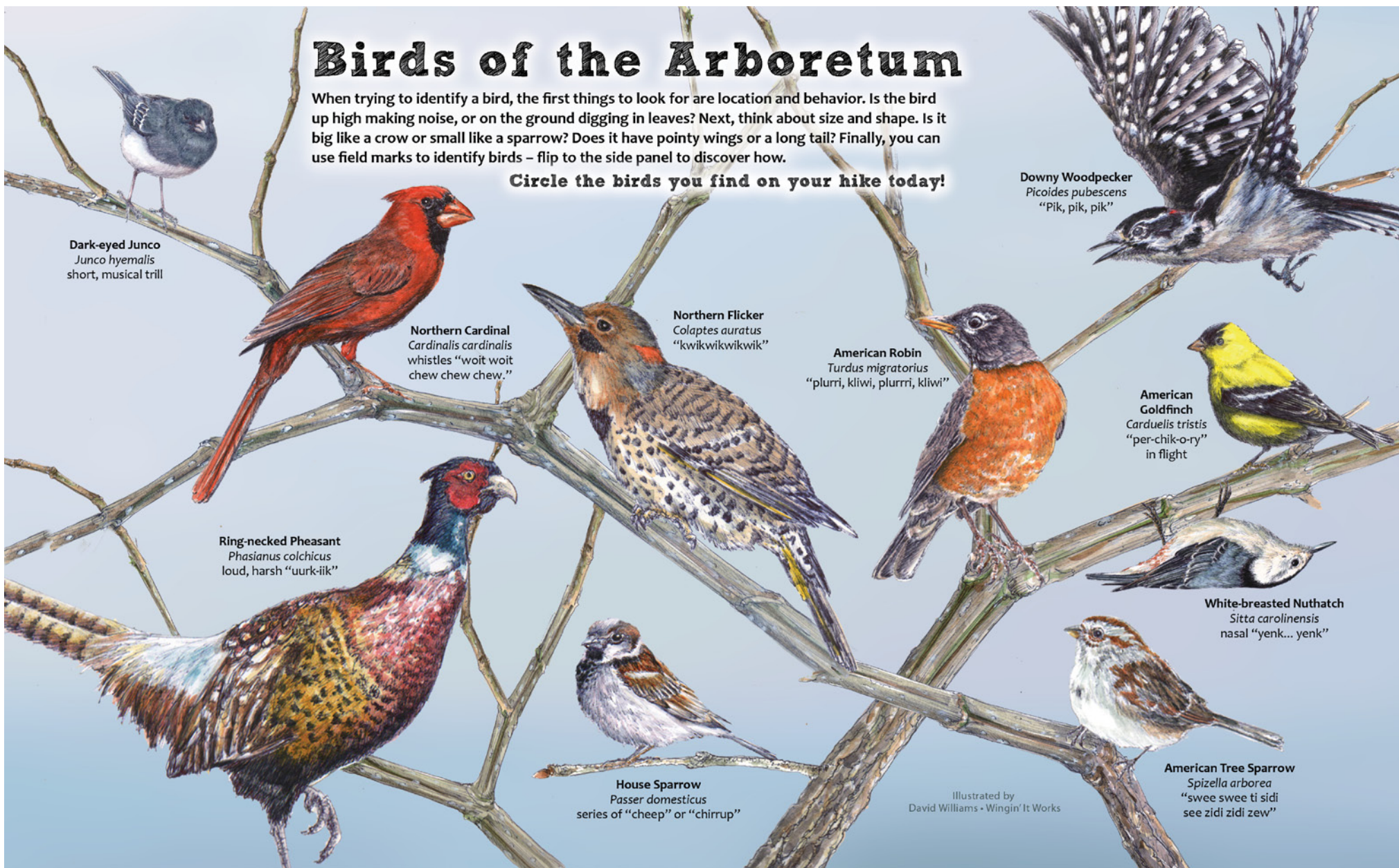
American Tree Sparrow Spizella arborea “swee swee ti sidi see zidi zidi zew”