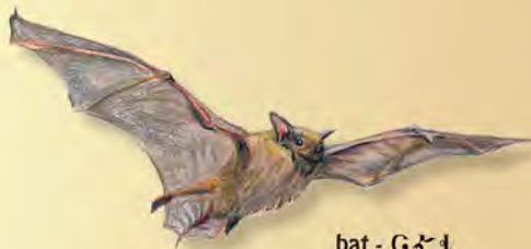
bat - G 4-4

The animals challenged the birds to a ball game. The birds accepted. As the birds were preparing for the game, a little animal as small as a mouse climbed the tree and asked to join their team. He said the animals made fun of him because he was so small. The birds pitied him and fashioned wings out of the groundhog skin that they used for their drum.